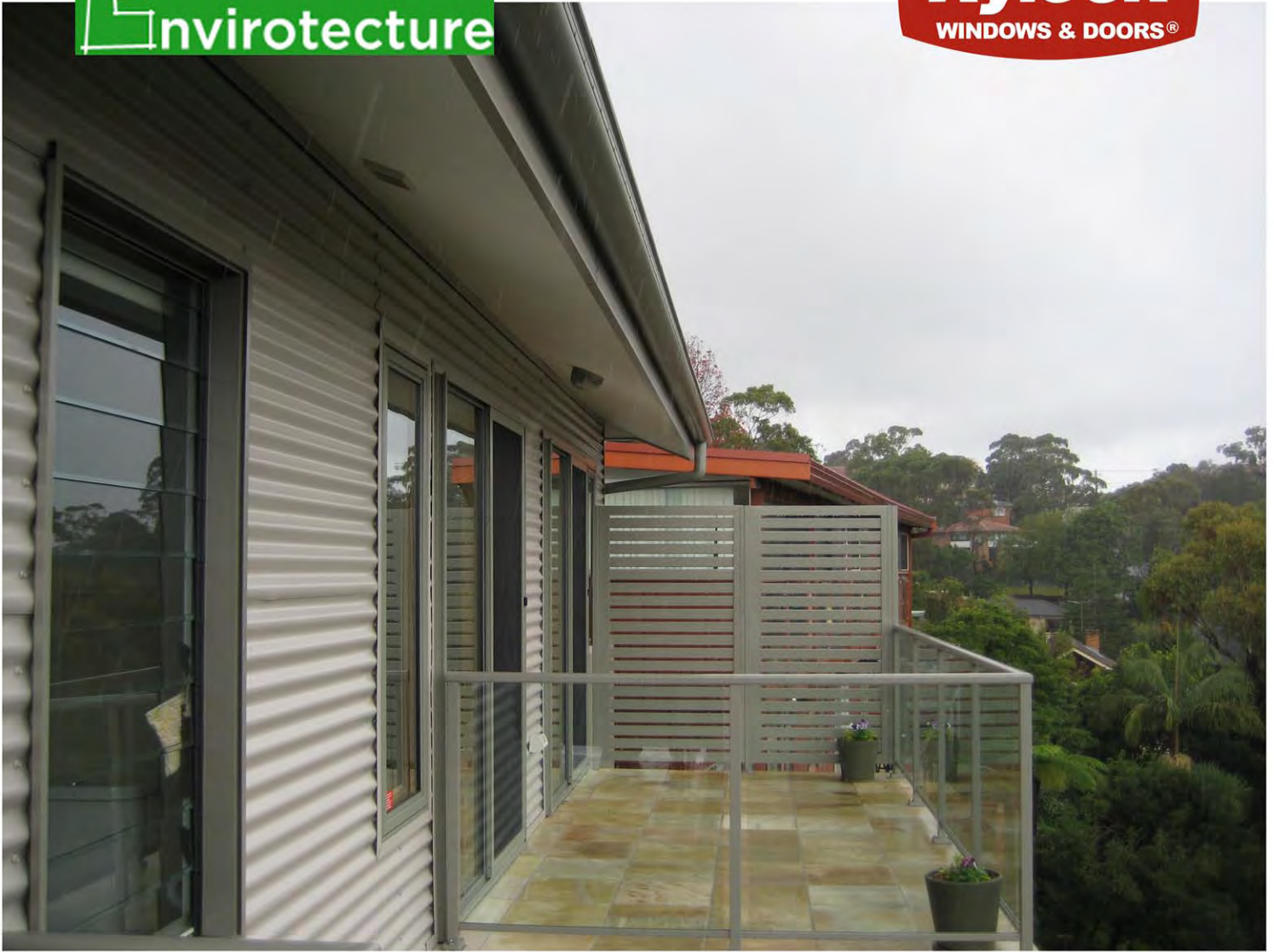
“Lolita House”, Forestville