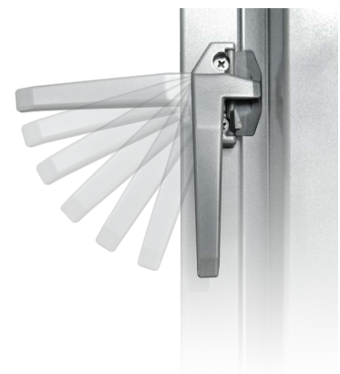
Wedgeless latches (in black, white & silver) make for a neat appearance & simple operation

Fixed Lite windows are based around a nominal 100mm aluminium frame depth, & are available with 3 options to suit different installation methodologies. Fixing fins are specific to the SA market, whilst optional hardwood reveals are ideal for an architaved internal finish in any location. Aimed at double-brick construction - common in NSW - custom brick brackets allow the frames to be easily installed into pre-prepared masonry openings. Ask your Rylock Sales Consultant how each of these options affect stud or masonry openings for your individual project