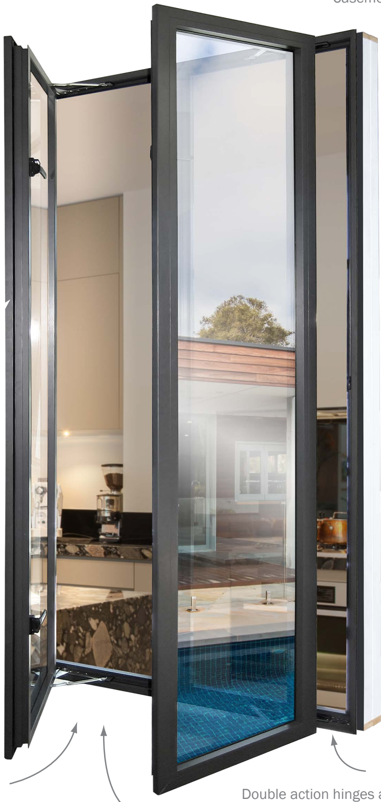
Double action hinges allow the sash to open fully, maximising airflow

All glass is installed into dual vinyl sided rebates, ensuring vibration free glazing. A co-extruded santoprene inner seal resists shrinkage & assists with weatherproofing